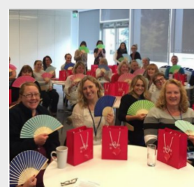
Severn Trent menopause awareness session

Tried, tested and trusted eLearning modules