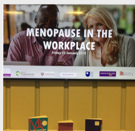
Menopause in the Workplace UK-wide events