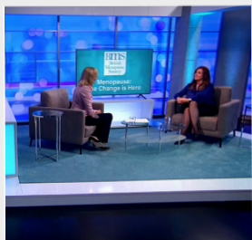
Menopause: The Change is Here - ITN Productions