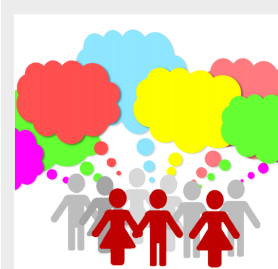
Video: Menopause in minutes